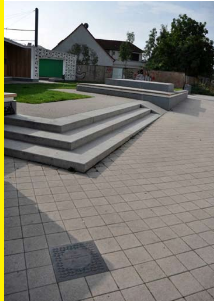
The Prize-winner's plaque now in place in front of the Open-Air-Library in Magdeburg.