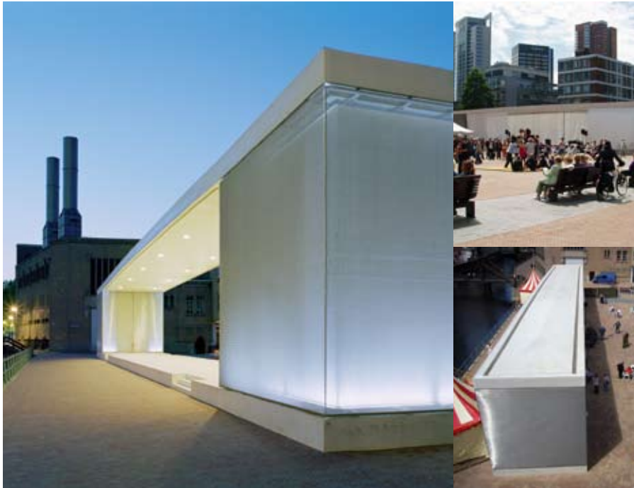
Urban Activators: theater podium & brug Grotekerkplein Rotterdam (The Netherlands), 2009

AUTHORS: Atelier Kempe Thill architects and planners DEVELOPERS: Rotary Club Rotterdam Noord, foundation 'Grotekerkplein', OBR Rotterdam