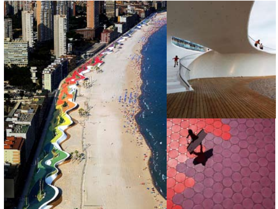
Paseo Marítimo de la Playa Poniente Benidorm (Spain), 2009

The insertion of a pavilion-cum-theatre programmatically revitalises the Laurenskerk cathedral square and articulates its relationship with the Delftsevaart canal.